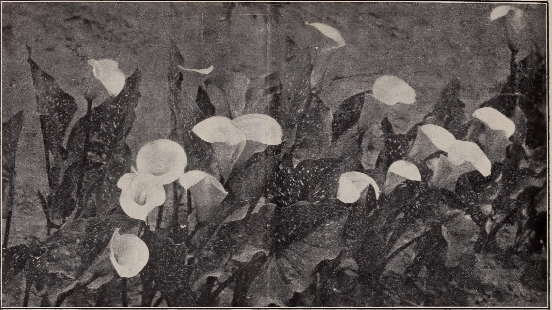
CALLA ELLIOTTIANA. AS GROWN IN OUR FIELD.